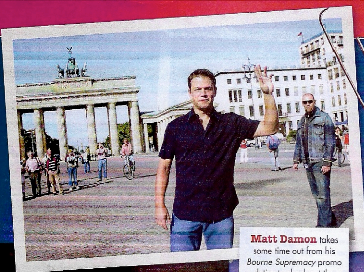
Matt Damon takes some time out from his Bourne Supremacy promo duties to check out the Brandenburg Gate