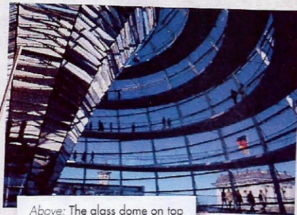
Above: The glass dome on top of the Reichstag. Main: The Brandenburg Gate, which was built from 1788 to 1791

Chic shopping, cool clubbing and celeb spotting – Germany's capital is a cultural hotspot with a cosmopolitan lifestyle to boot!