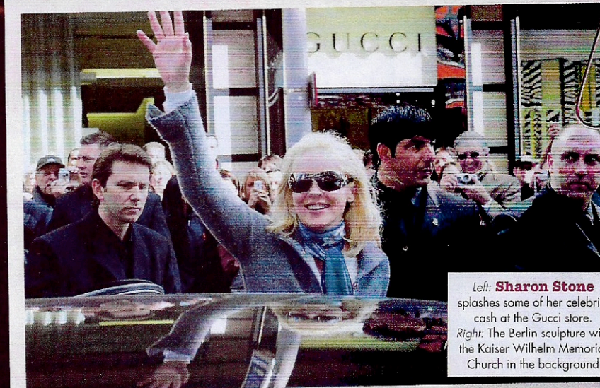
Left: Sharon Stone splashes some of her celebrity cash at the Gucci store. Right: The Berlin sculpture with the Kaiser Wilhelm Memorial Church in the background