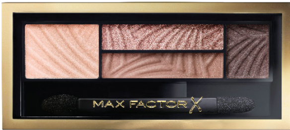
You'll need a good palette such as Max Factor Smokey Eye Drama Kit, $20.95.

A metallic finish or a little colour like navy or deep purple is right on trend. Try matte cranberry, plum and dark blue tones to update your smoky eye.