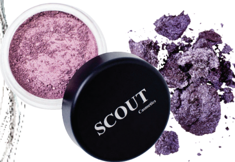
For colour, try very on-trend SCOUT Cosmetics Mineral Shadow Intensive in Lilac Wine, $29.95.