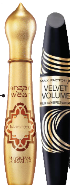
Max Factor Velvet Volume False Lash Effect Mascara, $27.95, creates intense volume while Physicians Formula Argan Wear Ultra-Nourishing Argan Oil Mascara, $24.95, is ideal for sensitive eyes. ■