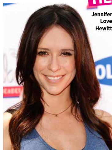
Jennifer Love Hewitt